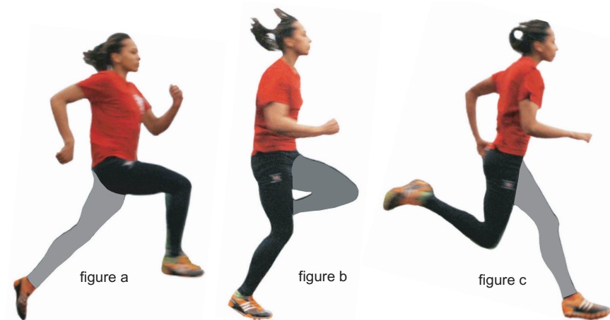
figure 4.28 – sprint – a full stride

a) Analyse the action of the hip joint from the strike position of the left leg to the completion of a full running stride.