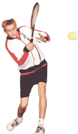
figure 4.27 – tennis forehand